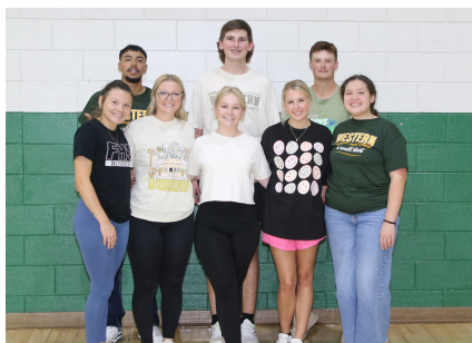
Members of the Western Ambassador team winning 3rd place.