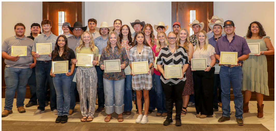
2024-25 Scholarships Recipients at the Agriculture Scholarship Luncheon

Western congratulates its Pioneer scholars and extends heartfelt thanks to those who continue to invest in the future of agriculture.