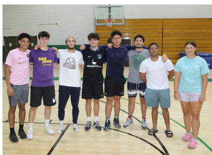
Members of the Hispanic Student Association team winning 1st place.