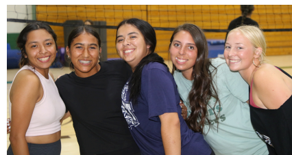
Students participating in the competition.