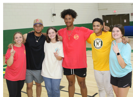
Members of the Baptist Collegiate Ministries team winning 2nd place.